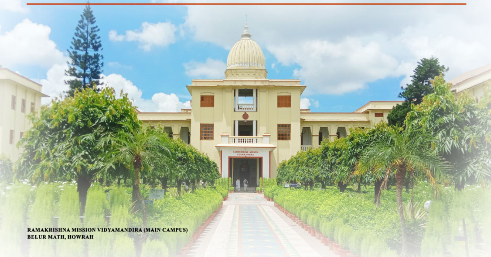
RAMAKRISHNA MISSION VIDYAMANDIRA (MAIN CAMPUS) BELUR MATH, HOWRAH